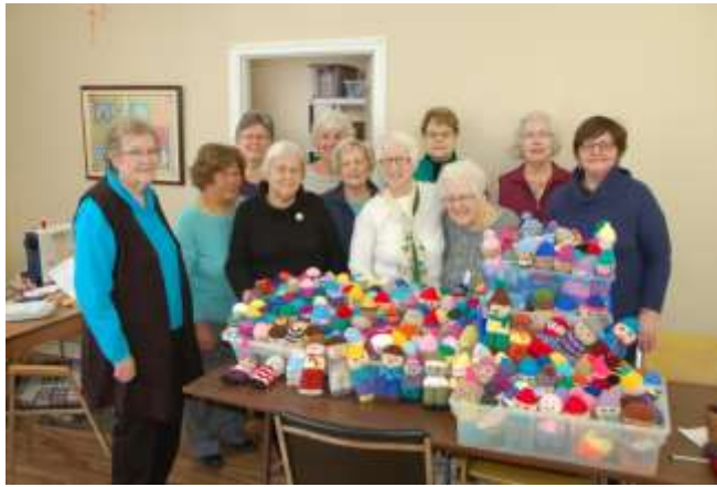
The Craft Club created 415 unique dolls for a mission to Cuba.

If you enjoy doing any of these following activities: