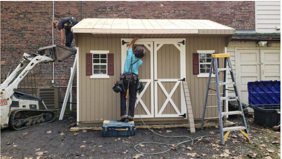
Our new shed, a gift from Sally Daly