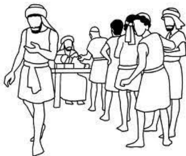
Parable of the Workers in the Vineyard