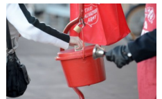
Photo Directory Published

If you would like to help, please sign up in the fellowship hall today.