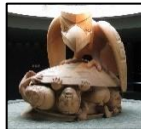
Bill Reid’s carving Museum of Anthropology, UBC

https://ravenreads.org/blogs/news/the-raven-in-haida-culture