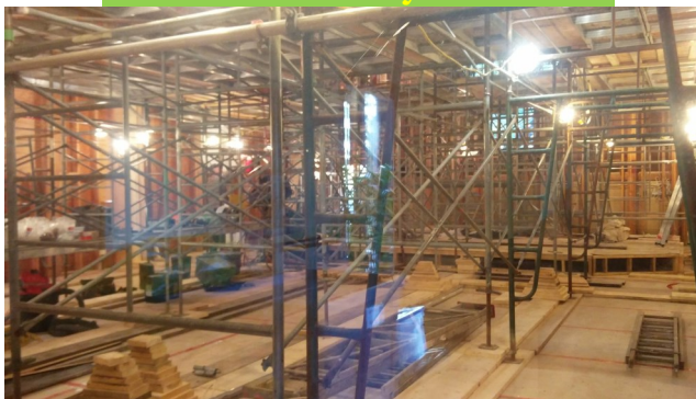
Our Sanctuary THEN