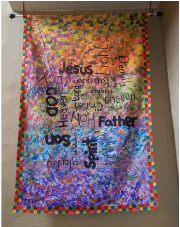
Banner given to Gloria Dei by the 2012 Confirmation Class

On behalf of the Confirmation Class of 2012