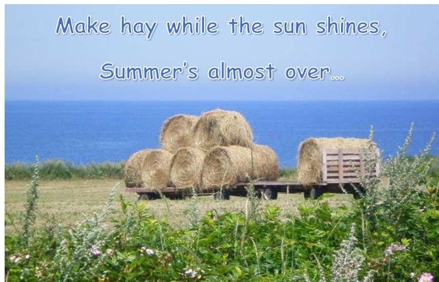
Photo taken on Prince Edward Island, August 2007