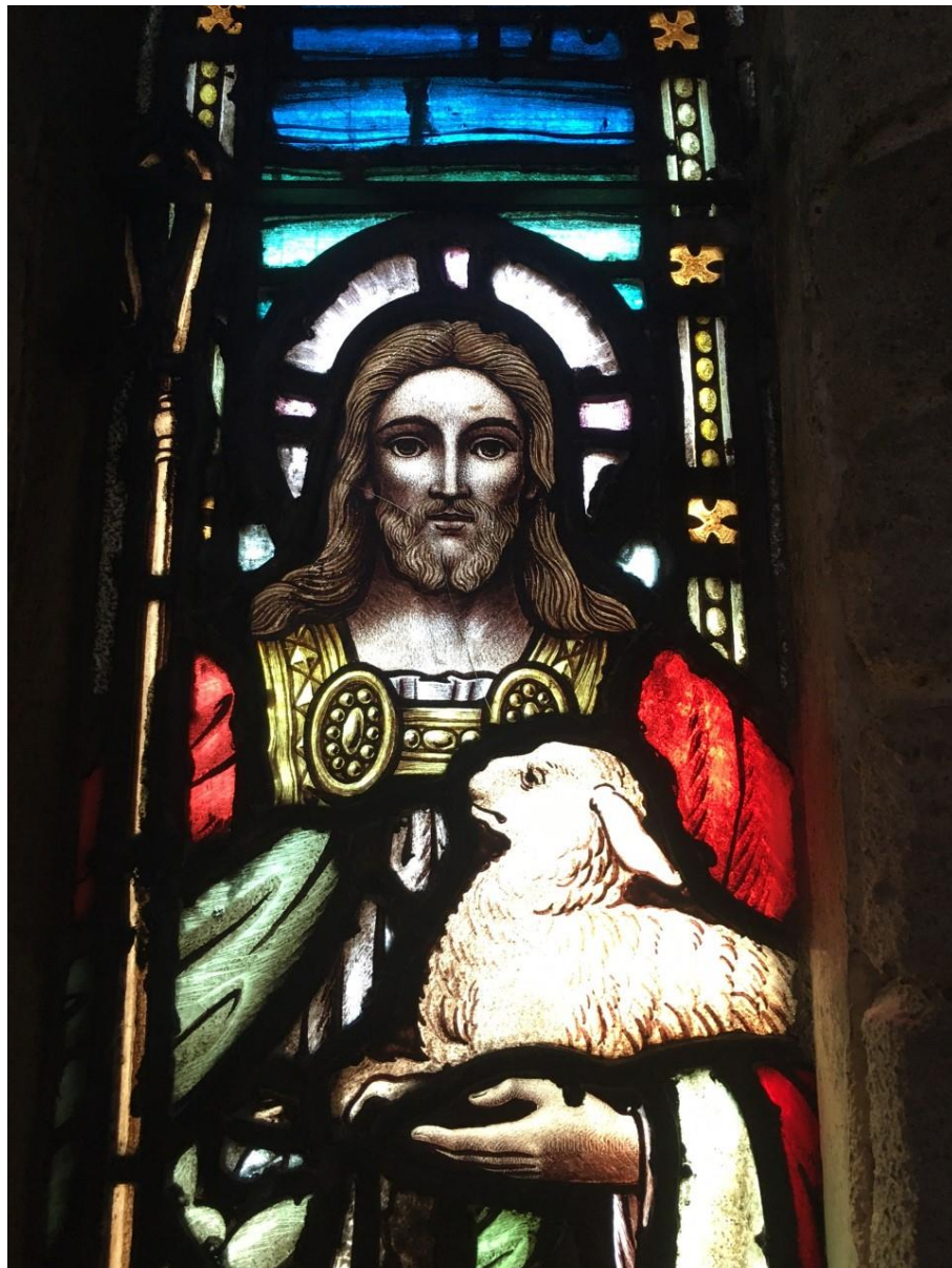
Window in The Church of St. John the Divine, Victoria, BC

We are an inclusive and affirming parish; the sacraments of the church (baptism, communion and marriage) are available to all people on equal terms. Christ welcomes you, and so do we.